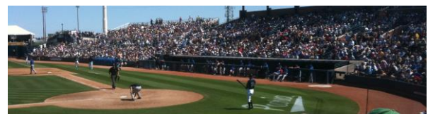
Figure 1: MOKE hysteresis loop for the bi-component Py/Co dots array measured along the dots long axis.

In the last decade, there has been an intense research activity in studying the spectrum of magnetic eigenmodes both in single and multi-layered confined magnetic elements with different shape and lateral dimensions [1–3]. This interest has been further renewed by the emergence of the spin-transfer torque effect, where a spin-polarized current can drive microwave frequency dynamics of such magnetic elements into steady-state precessional oscillations. Moreover, the knowledge of the magnetic eigenmodes is very important also from a fundamental point of view for probing the intrinsic dynamic properties of the nanoparticles. Besides, dense arrays of magnetic elements have been extensively studied in the field of Magnonic Crystals (MCs), that is magnetic media with periodic modulation of the magnetic parameters, for their capability to support the propagation of collective spin waves [4,5]. It has been demonstrated that in MCs the spin wave dispersion is characterized by magnonic band gaps, i.e. a similar feature was already found in simple two-dimensional lattices with equal elements like