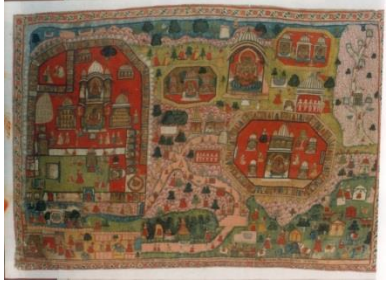
Figure 6: Calculated frequency evolution of modes detected in the BLS spectra.

In Fig. 6 the calculated frequencies of the most representative eigenmodes at +500 Oe (FM state) and − 500 Oe (AP state) are plotted as a function of the gap size d between the Py and Co sub units (please remind that in the real sample studied here, d = 35 nm). As a general comment, it can be seen that the frequencies for the system in the AP state are more sensitive to d than those of the P state. In particular, the lowest three frequency modes of the AP state (EM(Co), EM(Py) and F(Py)) are downshifted with respect to the case of isolated elements (dotted lines) and show a marked decrease with reducing d , while the two modes at higher frequencies (F(Co) and IDE(Py)) have an opposite behavior even though they exhibit a reduced amplitude. In the P state (right panel), the modes concentrated into the Py dots exhibit a moderate decrease with reducing d , while an opposite but less pronounced behavior is exhibited by the F(Co) mode.