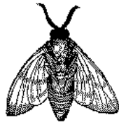
Figure 2: A sample black and white graphic (.eps format) that has been resized with the epsfig command.

THEOREM 1. Let f be continuous on [a, b] . If G is an